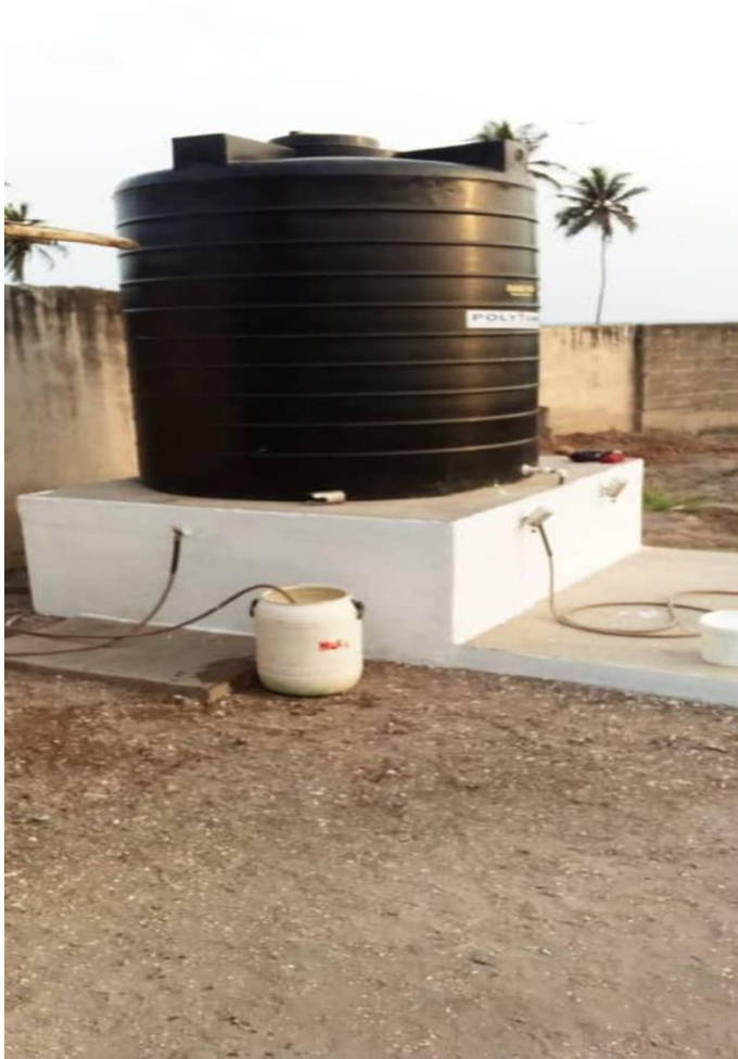
SIDE VIEW OF MOUNTED POLYTANK

This water storage tank is a large rotational moulded durable plastic container and hidden away in the water tank is small device called a ball Valve which BHA purchased to help control the level of the water in the tank.