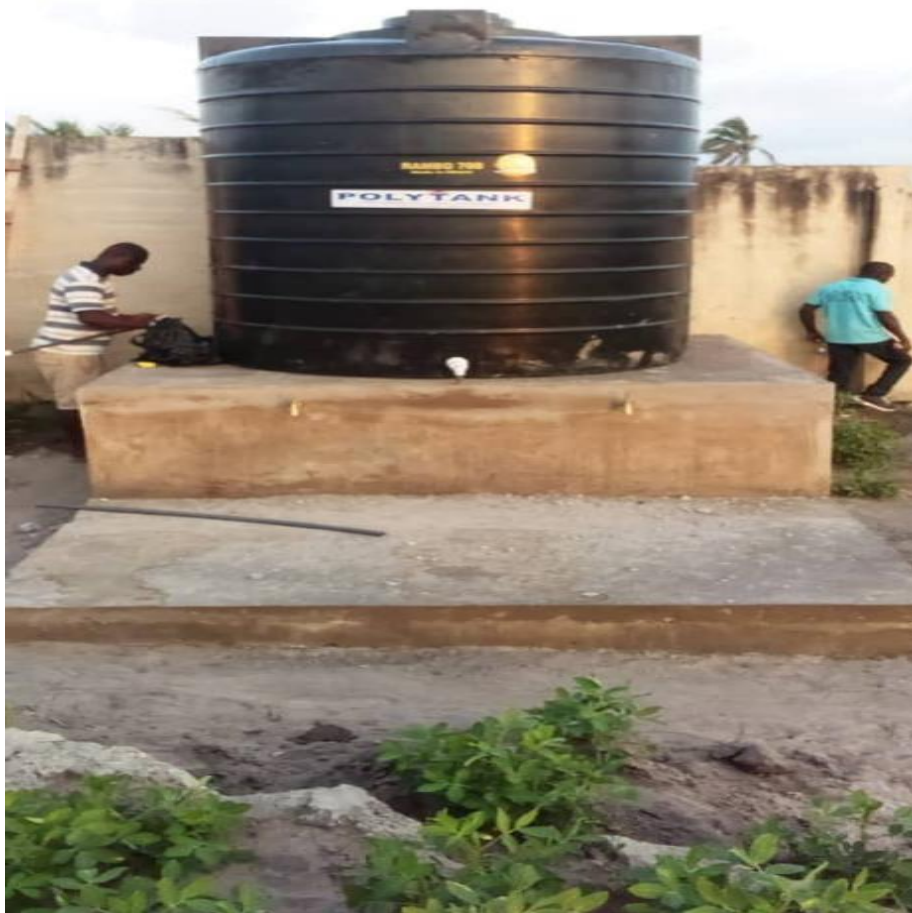
NEARLY FINISHED CONSTRUCTION OF PLATFORM FOR THE STORAGE TANK

BHA is proud to inform our readers that the water project at Sankor Community is 95% completed and will be commissioned in June