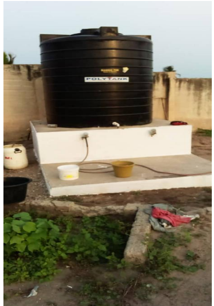
FRONT VIEW OF MOUNTED POLYTANK